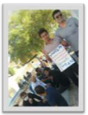
A photo from 62nd day of strike!

Support Center for Iranian-Vienna People's Struggles